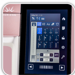
High-Def 5" LCD Color Touchscreen