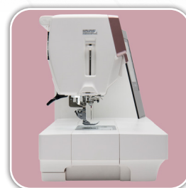
Improved Ergonomic Design