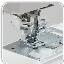
Detachable AcuFeed™ Flex Layered Feeding System